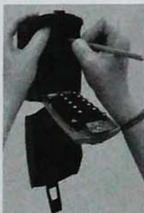
Yellow dial set (Arrow pointing away)